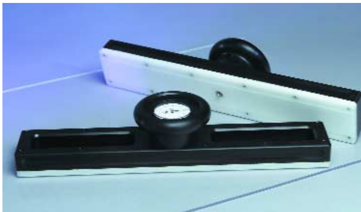
Figure 4. Flat-bottom roll wave gauge with analog dial readout.