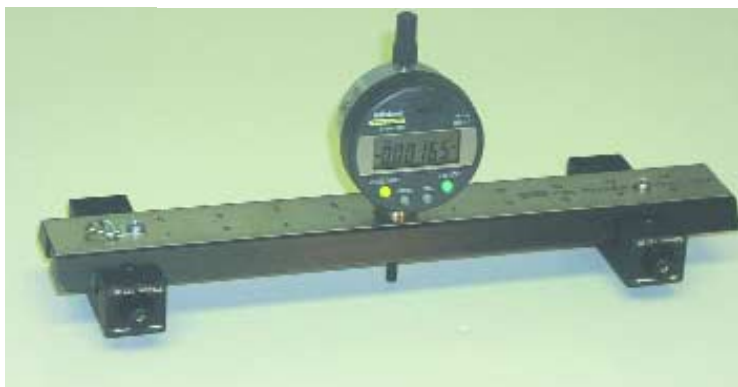
Figure 5. Three-point roll wave gauge with digital readout

output to a PC or chart recorder. These instruments measure out-of-plane deformation (peak-to-valley depth), which must be converted to millidiopters using a standard equation to arrive at a true value for optical distortion.